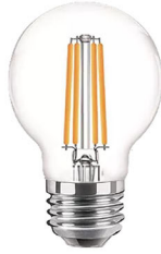
G - Globe Standard Base E26