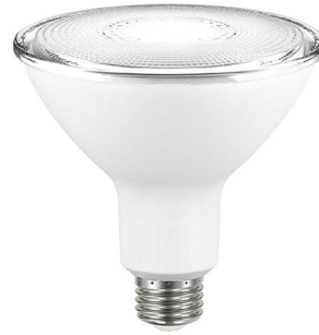
R - Reflector Standard Base E26