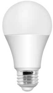
A - Arbitrary Standard Base E26