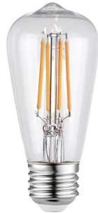
E - Edison Standard Base E26