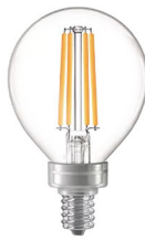
G - Globe Candelabra Base E12