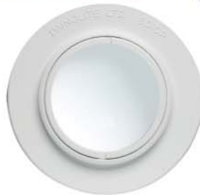
"8D" LENS 8 diopter clip-on lens Clips below existing lens Increases magnification by 3X