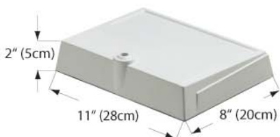
"E" BASE Heavy weighted table base Weight 25lbs