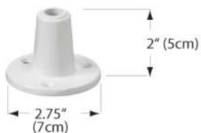
"C" BRACKET Permanent table mounting bracket