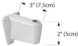
"B" BRACKET Wall mounting bracket